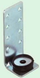
Duct hanger LKH