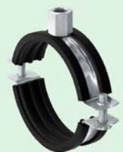
Pipe clamp FRSM