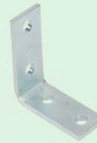
Bracket FAF 4