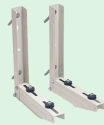
Air conditioner fixing MCE