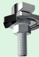
T-head bolt FHS Clix