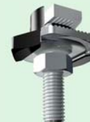
T-head bolt FHS Clix