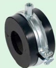
Refrig. pipe clamp FRS K